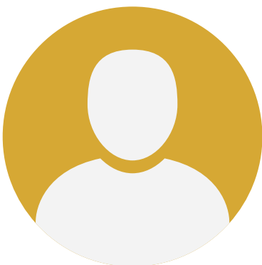
DEAN OF STUDENTS

The requested budget is for a new employee who will work two days a week.